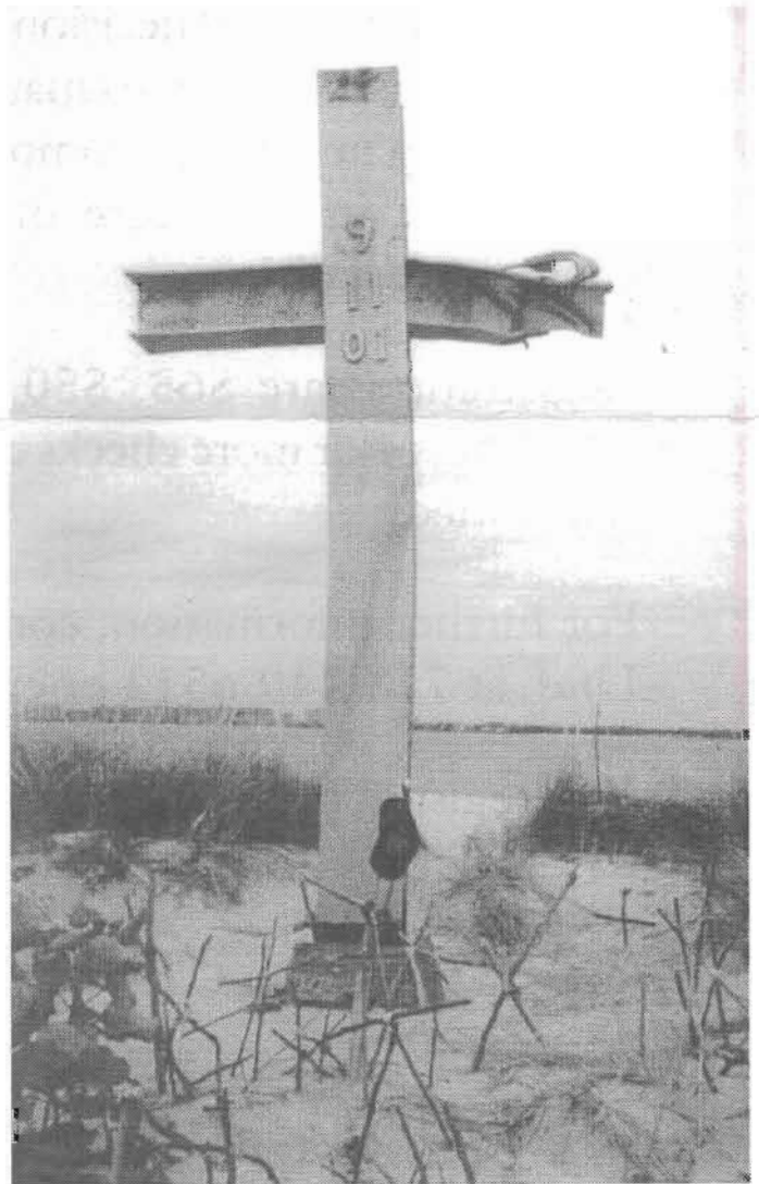
September 11 Memorial at Breezy Point, the community which lost the greatest number of rescue workers. The cross was made of steel removed from the World Trade Center rubble. The cross stands in a direct line of view from where the WTC stood.

This past year has seen Americans engaged in a war on terrorism and a debate on how best to preserve and protect our American way of life. ER nurses are an integral part of this, both as citizens and as first line responders and rescuers. We should participate with our intelligence, our talents, and our enthusiasm.