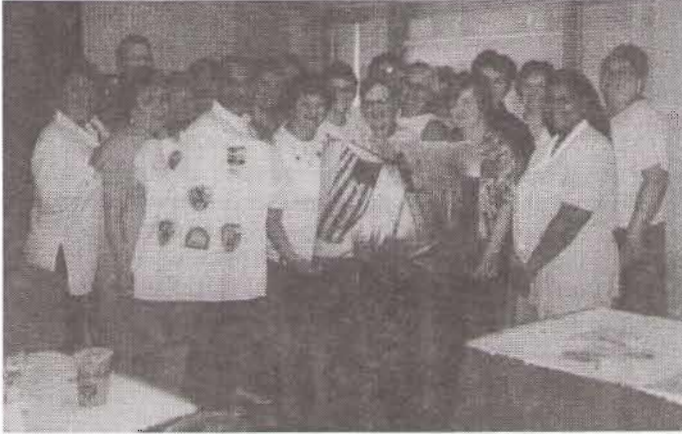
NYS Council members display some items from the 9-11 Fund raffle.