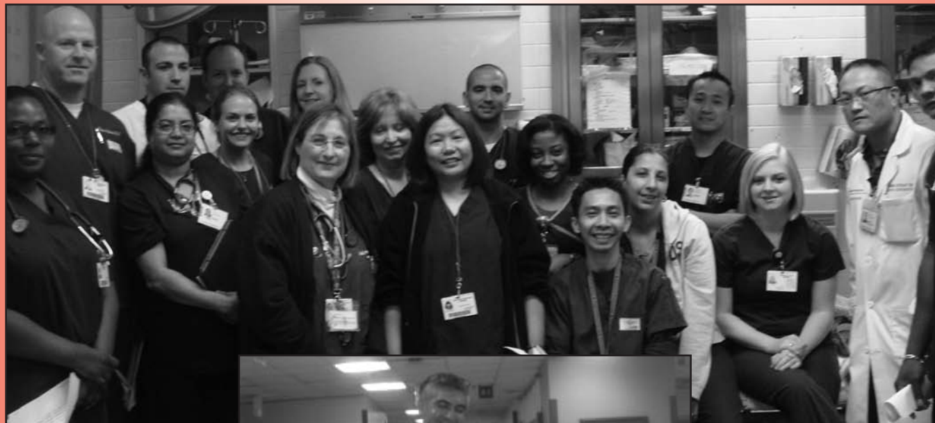
Emergency Nurses at NYP Columbia ED

Submit a short article to the editor at pparker39@optimum.net by November 7. Photos welcome.