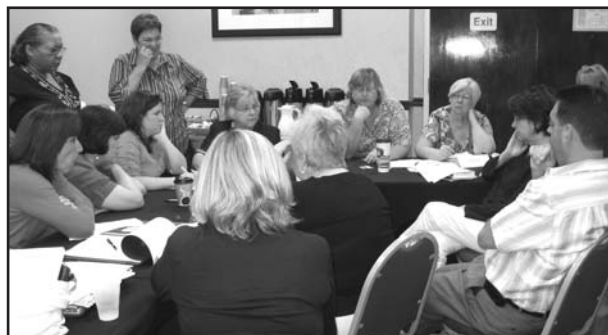
NYS ENA August Committee Meeting

See you in Baltimore! Be prepared to be Strengthened, Transformed and Transcended!