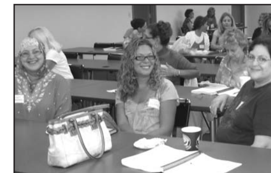
Suffolk CEN Class