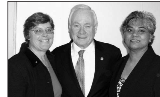
NYSENA members meet with Sen. Golden