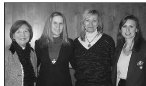
NYSENA members with Legislative Assistant