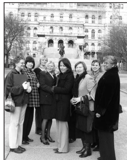
NYSENA members meet in front of the State Capital, Jan. 26, 2010

Editor's Note: Although the Legislative Breakfast was cancelled, some members were able to make appointments and meet with their legislators. See photos in this newsletter.