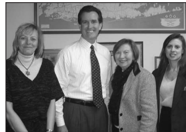
Sen. Flanagan with NYSENA members