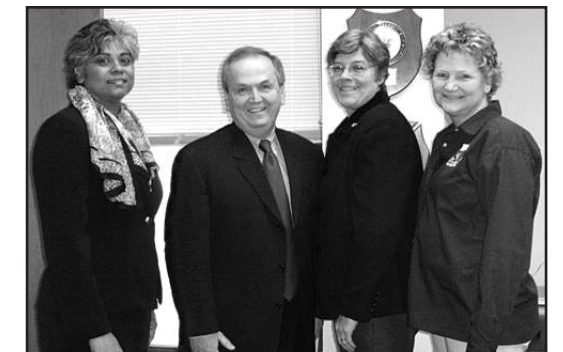
Sen. Maziarz with NYSENA members