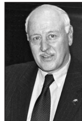
New York State Sen. LaValle