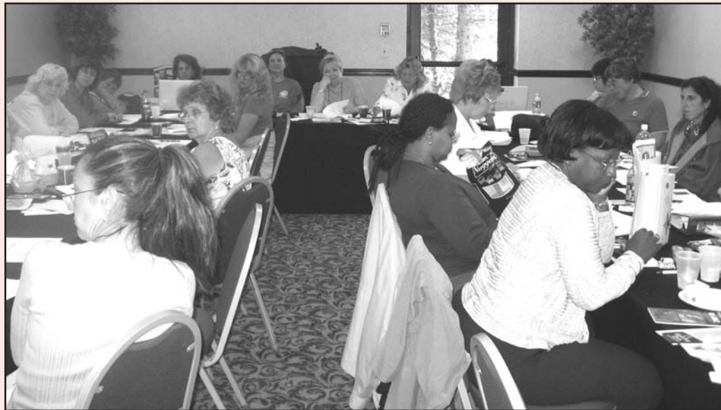
August State Council Meeting