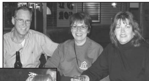
Time For Relaxation