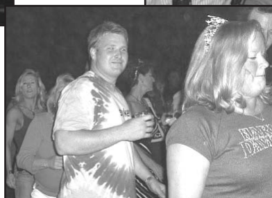
Dancing With Our Stryker Friend