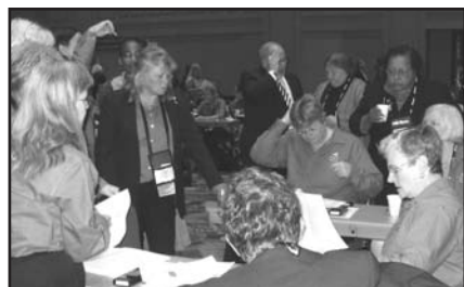
Caucusing at General Assembly