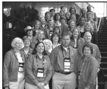
ENA group photo