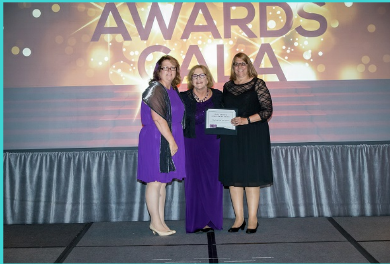
Receiving the State Achievement Award at the ENA Awards Gala in September.