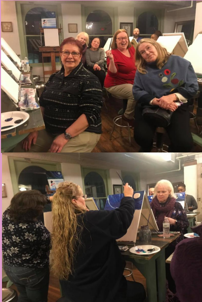
The finished product